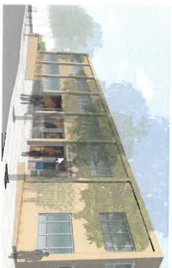
Maxine Hall HC Rendering