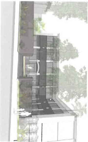
Castro Mission HC Rendering