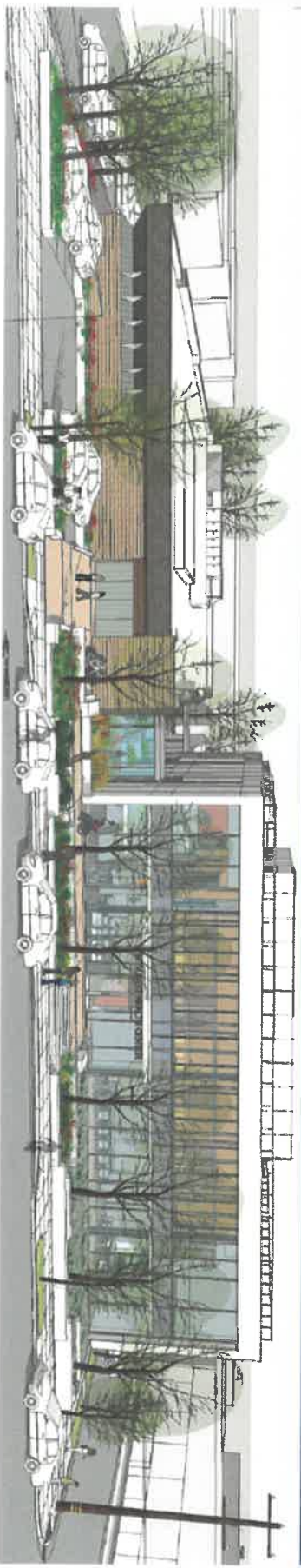
Existing Southeast Health Center